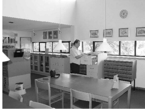
Interesting and diverse items in the files

wide variety of topics, many similar to those covered by the newspaper indexes. Highlights include the brochures of candidates running in federal, provincial and municipal elections; articles related to the debate on establishing a Level-4 virus laboratory in Etobicoke; material on the