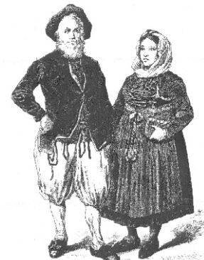
Huguenots (Toronto Reference Library)